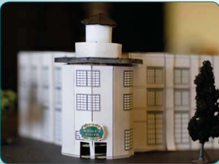
This model of a brick-and-granite station (above) designed by New Bedford students was inspired by Wamsutta Mills and the Butler Flats Lighthouse. It was recognized as one of the Best Overall Designs.