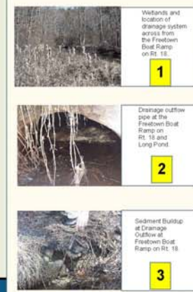
Photo 1, 2, & 3 show drainage at the Freetown public boat landing area. The culvert-style drainage system has much sediment buildup at the outflow pipe which deposits drainage into a separate wetlands area, flowing for several hundred feet before emptying into Long Pond. There is standing water in the drainage swale. The wetland is forested, open water with cat tail and shows signs of siltation and vegetative encroachment. The water has minimal flow. Roadway condition is good. Long Pond is a designated Outstanding Resource Water and a Zone II surface water supply protection area. The pond is also a Priority Habitat and part of the Assonet Ponds Water Supply network. In addition, it is located near Open Space, Cranberry Bogs, and a public drinking supply water area. Overall, slope of the land is between 1% - 30%. The pond is also used as a recreational swimming area.