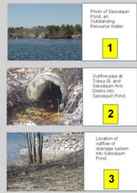
Photos 1, 2 & 3 show a drainage system in a heavily developed residential lakfront neighborhood on Sassaquin Pond. System has a catch basin with overflow. There is direct discharge to pond when pipe and catch basin overflow. Condition of road is good. The system is in a designated Outstanding Resource Water area, and is in proximity to wetlands, a Certified Vernal Pool, Open Space, and Cranberry bogs to the west. Slope of land is between 3-5%.

All of New Bedford falls within the Buzzards Bay Watershed