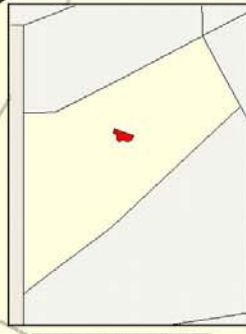
Inset of Watershed Location